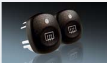
Day and night design in the automotive industry.