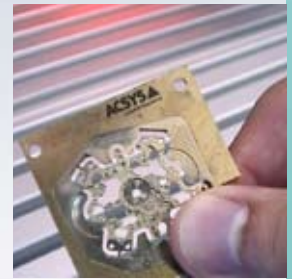
4. Remove the perfect result and continue with the next project.