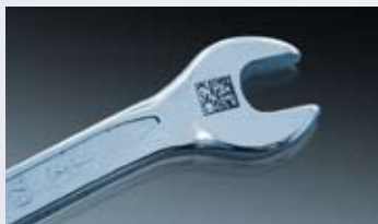
Laser marking of DataMatrix Codes.