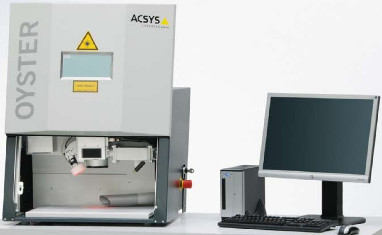
OYSTER® with electrical lift door, NC-controlled z-axis and LAS - Live Adjust System®.