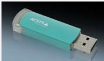
Laser marking of advertising specialties.