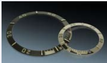
Laser machining of diver's bezels