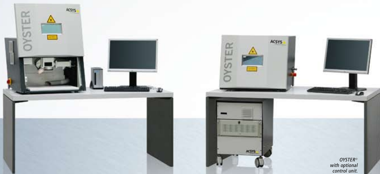
OYSTER® with optional control unit.

Laser sources feature long service life. Easy accessibility reduces maintenance and service expense to a minimum. Shortest response times around the clock and a qualified online support service with the very latest diagnostic systems ensure system availability. Our Spare and Wear Parts Centre also maintains a wide assortment available directly from the warehouse.