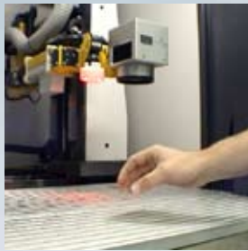
1. Insert the piece to be processed.

The camera set-up module LAS - Live Adjust System® at a glance.